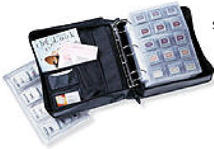
Sample Organizer $35