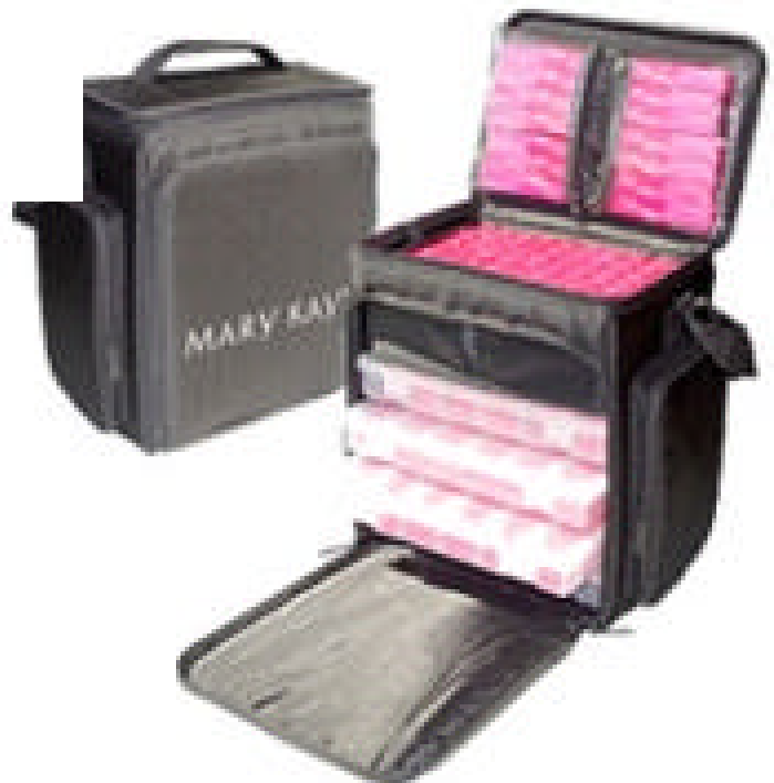
Slip-On Color Case $49