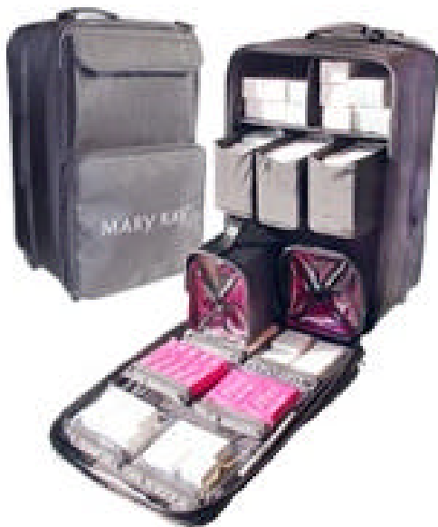
Wheeled Cosmetic Carrier $119

Check out these fabulous items by clicking on "MKConnections" on the Mary Kay InTouch web site under "Services & products."